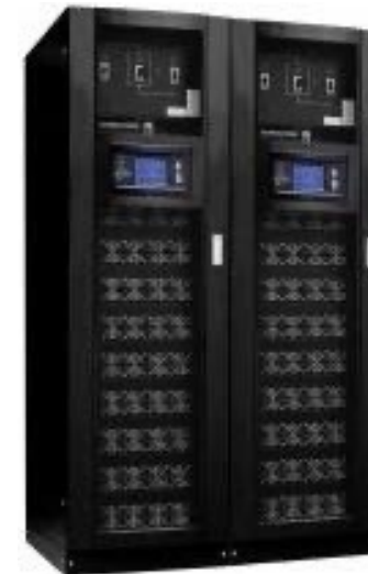
Modular UPS -500kVA