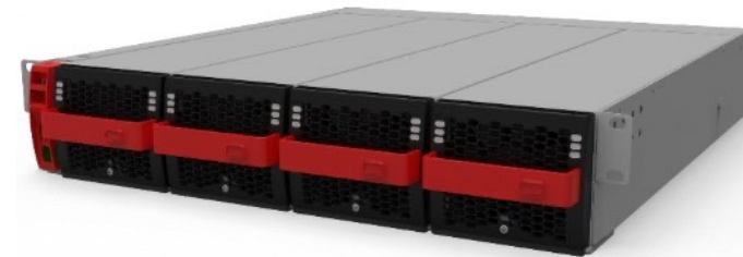
4 x 3kVA INVERTER IN 2U 19" RACK MOUNT