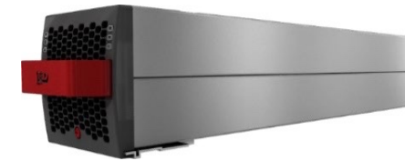
INVERTER MODULE -3kVA