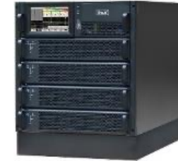
Modular UPS -60kVA 19" Rack Mount