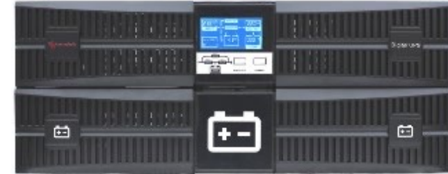
UPS + BATTERY PACK IN 19" RACK MOUNT