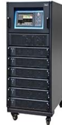
Modular UPS -90kVA 19" Rack Mount